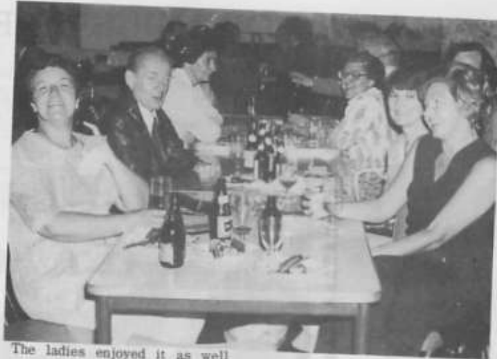
The ladies enjoyed it as well