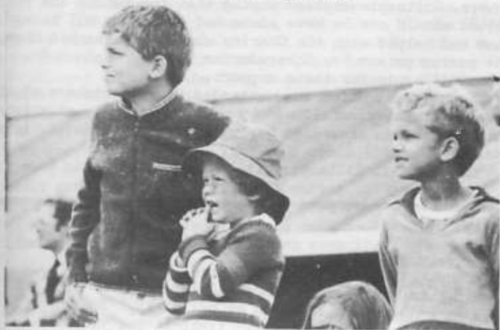
Tension in the crowd.