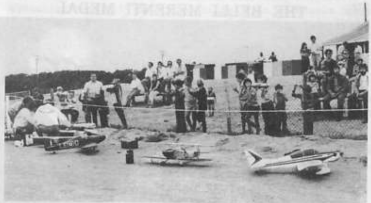
More of the beautiful models.