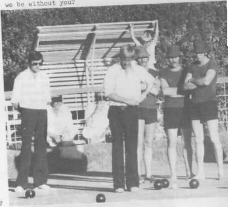
Runners up checking on the winners.

Hope to see you all again next year, when we hope to better this year's record figure of R1707.18. Thank you thank you, all you wonderful generous people. Where would we be without you?