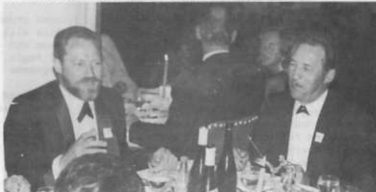
Toe wou hulle ons nog "Keel Haul" ook!

Tot dan, stywe lyne vir die nuwe seisoen!