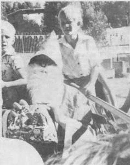
Father Christmas was there too!

Excitement built up late Saturday afternoon when our important visitor arrived (Father Christmas). I feel sure that all parents will agree, that the look of wonderment, expectancy and joy on the children's faces when this gentleman arrived, is something to be treasured.