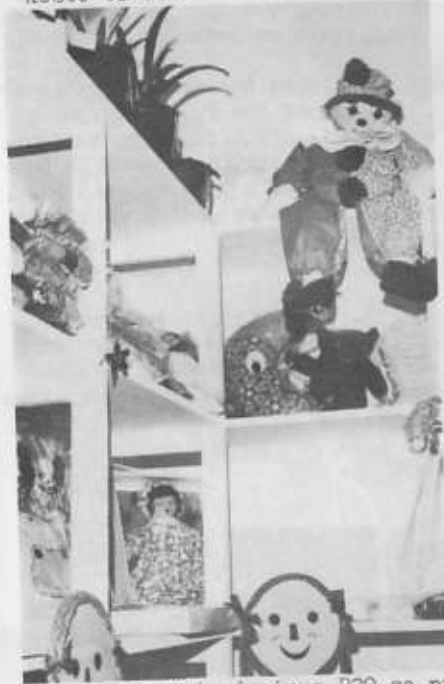
Speelgoed te Kies en te Ke

Enige persoon kan by hierdie vereniging aansluit, die gewone intree fooi van R2 aan die Ontspanningsklub is betaalbaar. Tuisgemaakte en gekweekte produkte kan gelewer word, dit word deur die lid geprys en 5% van alle verkoopte items van elke lid word deur die winkel gehou om bedryfskoste te dek.