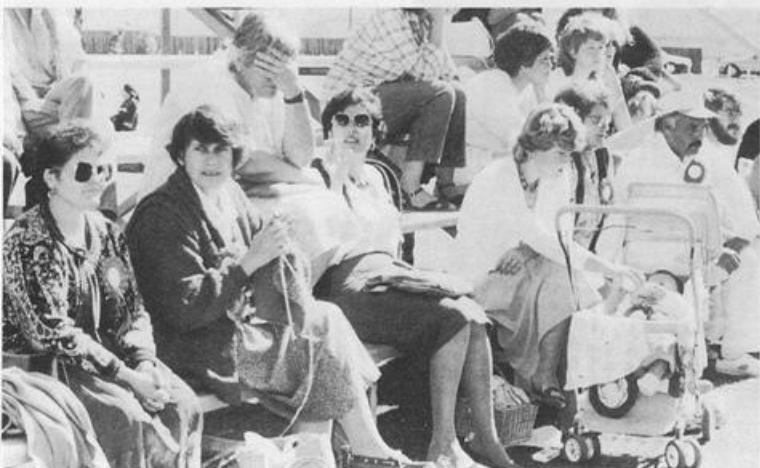
Spectators empathise with the disappointed CDM first aiders.