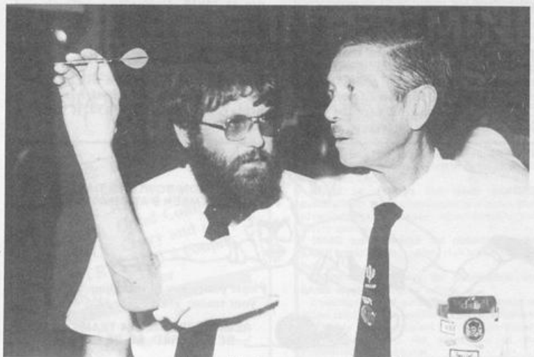
Winners of the darts tourney, visiting Kathu men.