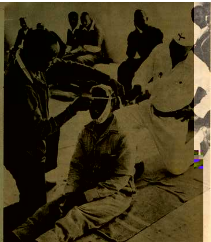
Ovambo miners are taught first-aid by qualified instructors. They can also attend classes in tribal arts and crafts.