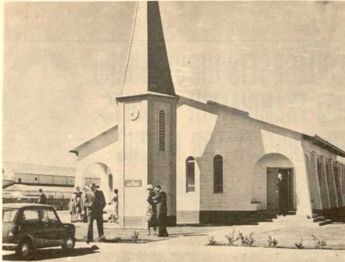
Oranjemund has an interdenominational church building, a Roman Catholic chapel and a Dutch Reformed Church to cater for the religious requirements of the miners and their families.

can buy groceries and household necessities at cut-rate prices in a modern departmental store run by the company. The company has its own farm on the Orange River to provide fresh fruit and vegetables throughout the year, and its own abattoir, to slaughter animals and provide high-grade meat at prices that would be the envy of housewives elsewhere. Servants (all male) are subsidized by the company.