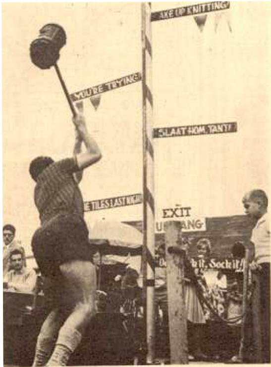
Oranjemund is a town of young people, with a high child population. Here, at a fun-fair, one of them tries his luck with this hammer.