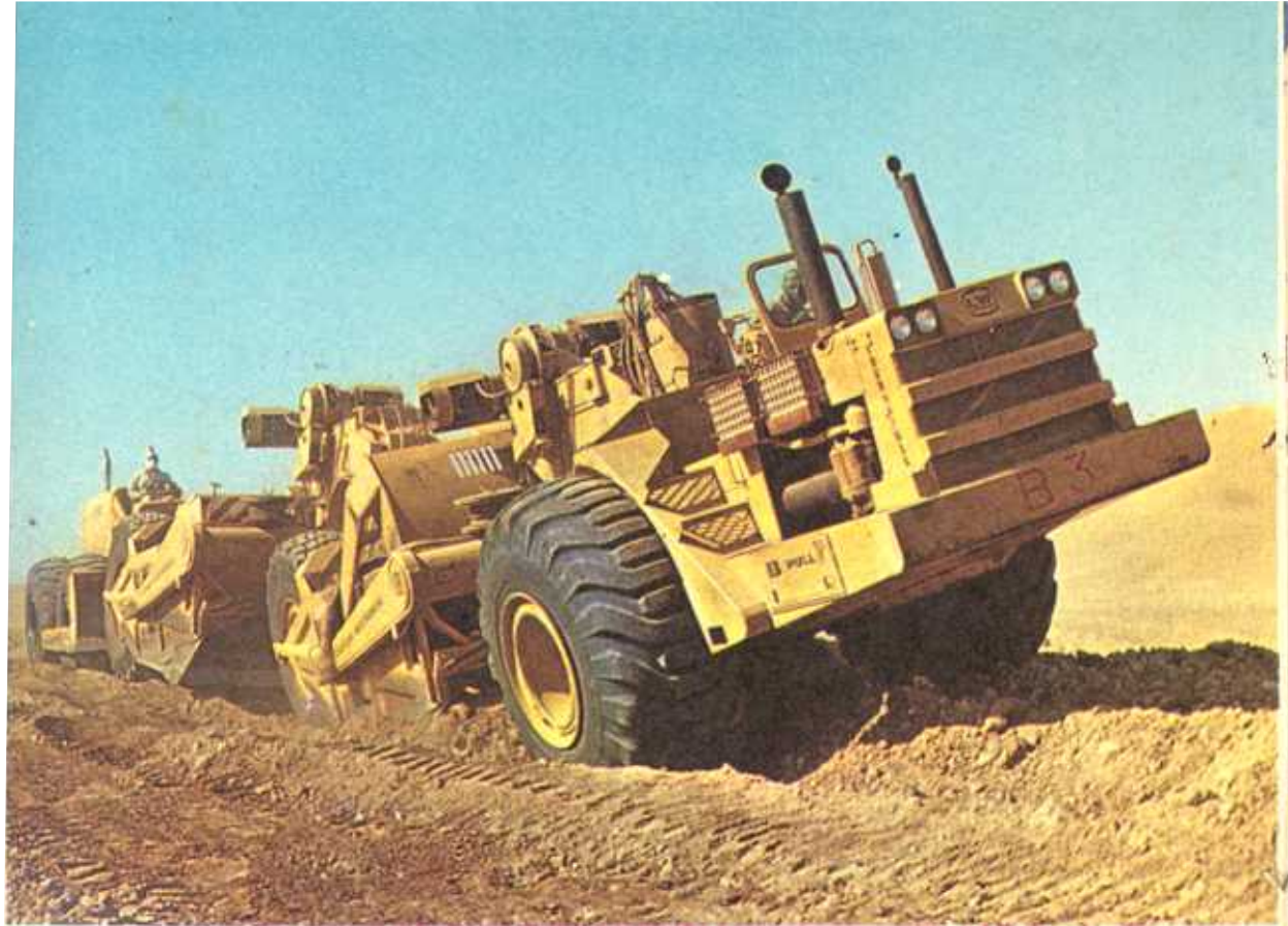
Above: To find those elusive little diamonds man has to use mighty, heavy machines such as this, which rip up tons of earth at a time, clearing away the overburden of sand to expose the diamonds.