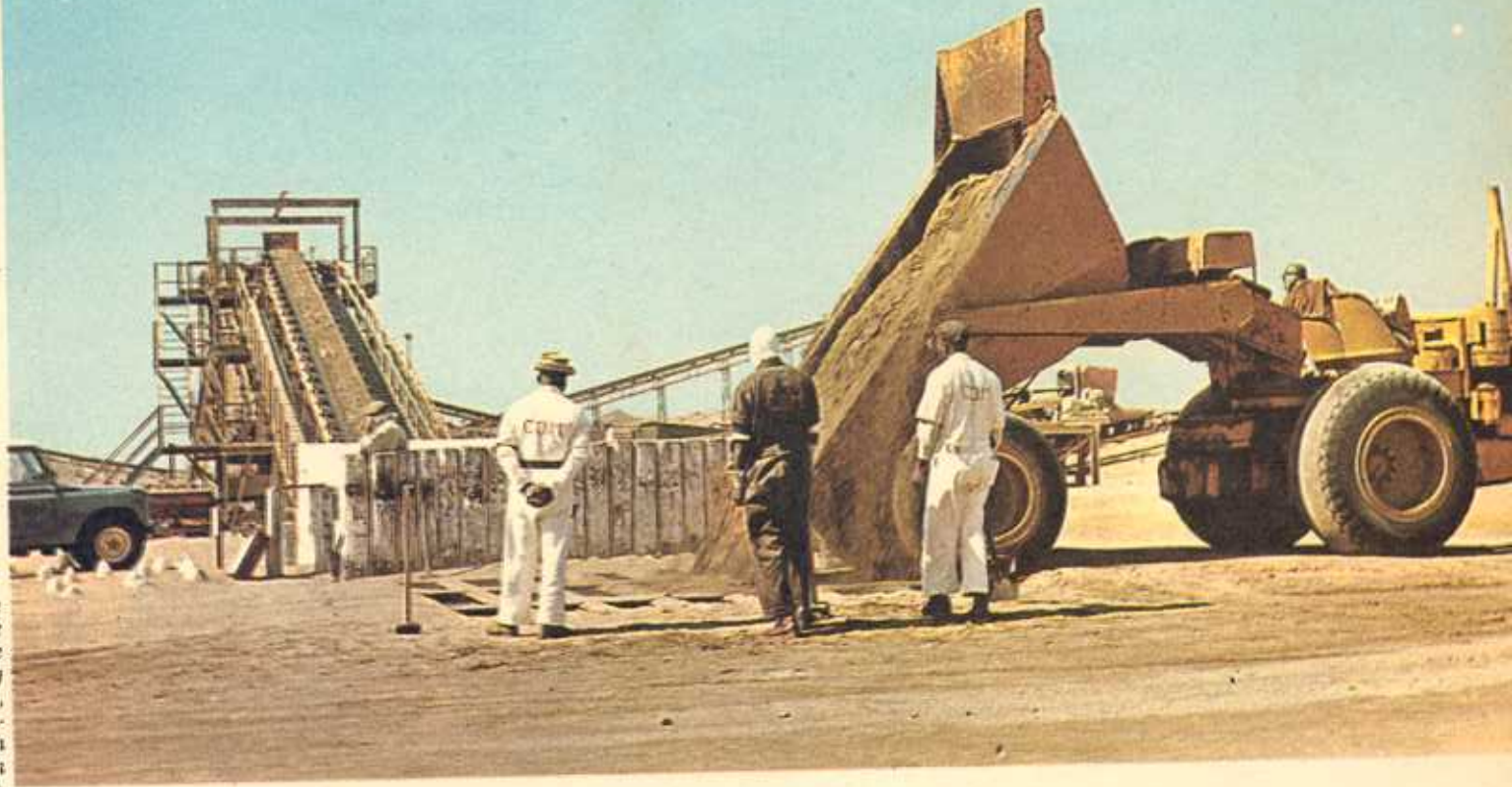
Before the diamonds come into human hands they have to be separated from the sand and gravel in a long mechanical process of sifting, vibrating, washing and floatation which starts here with the dumping of the rough bulk on to a conveyor belt.