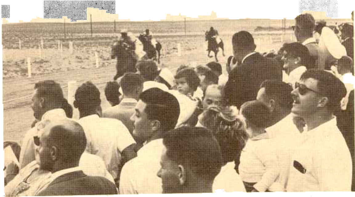
One of the annual highlights at Oranjemund is the "Mule Derby". Nowadays they use horses, but it all started with mules, and the "jockeys" are still brawny Ovamboland miners. Like a flutter?