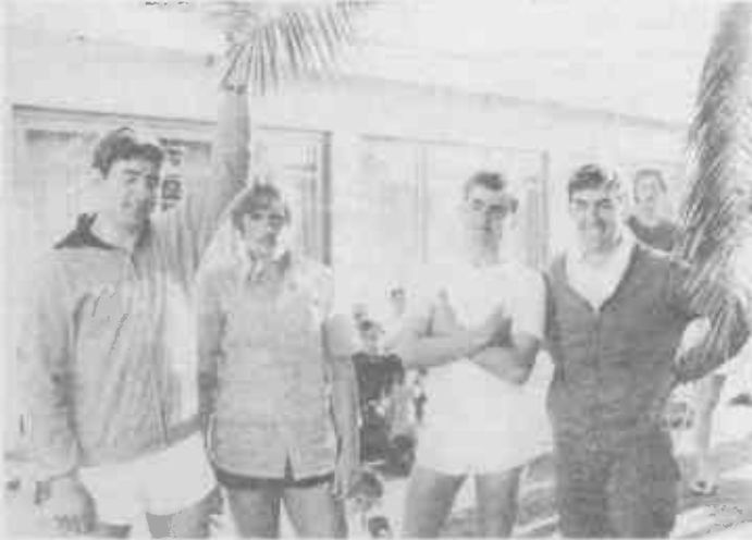
The Squash Club team, (2nd) had three schoolboys in their team

Saturday morning, October 4 started with strong east winds, such that by lunch time the temperature was so high (28 degrees C) that the thought of running was almost unbearable. In spite of this, by 2.30 p.m. ninety seven stalwarts of both sexes and every age group from 7 up to 55 had entered the race. When the runners arrived at the Pink Pan, the weather had changed completely so that the cold west wind had most people huddling in corners until the start of the race.