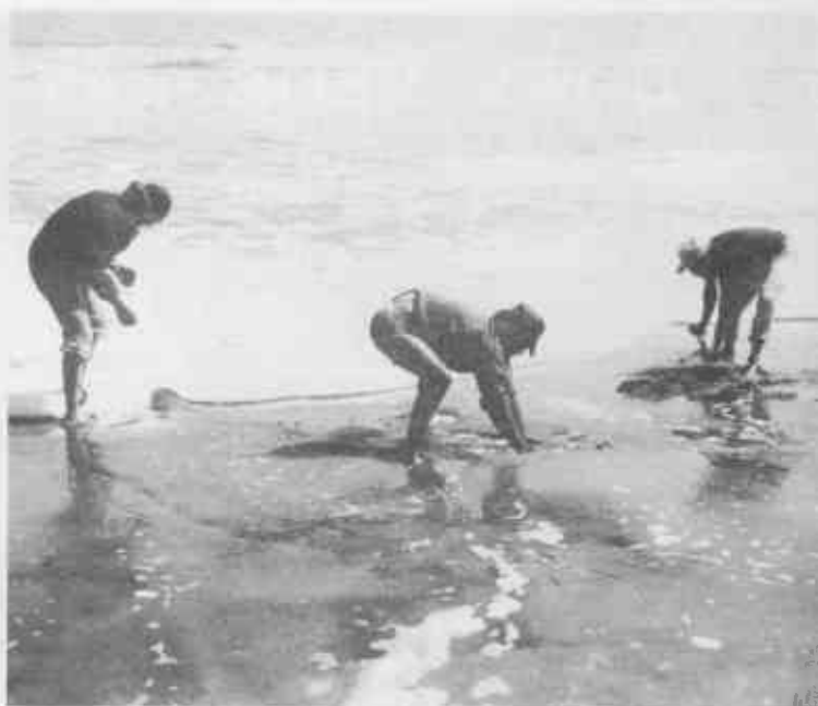
Gathering mussels for bait - the hand and shovel gang

and there's time for an afternoon's excursion to the beach. A tall, wooden beacon, a cormorant usually perched atop is the nearest point and landmark on the beach. Not much joy in the fishing today. Can't remember anyone catching