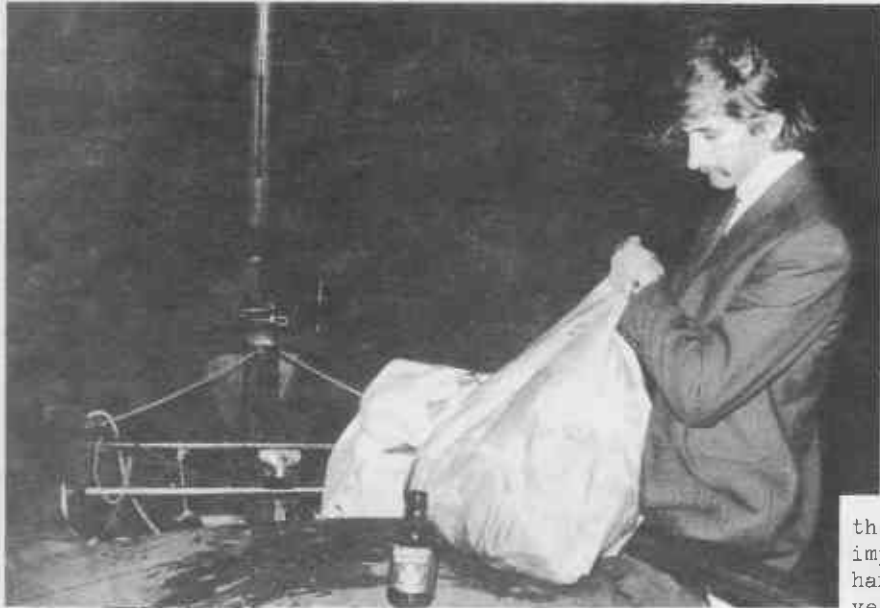
Some members couldn't wait and started preparing their boats instead of drinking and dancing at the pre-season party sailing. Just goes to show what plenty of practise during the off season can do. On Sunday 21st September the first three races of