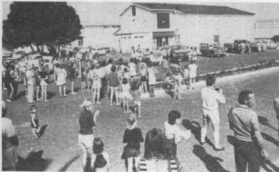
The crowded scene at the finishing tape opposite the Recreation Club. Very handy for a cooling beer!