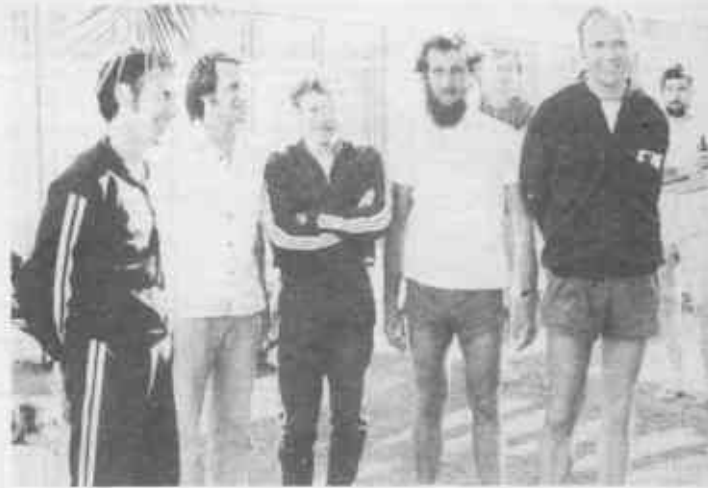
Understandably, the Athletic 'A' team was 1st in the team placings