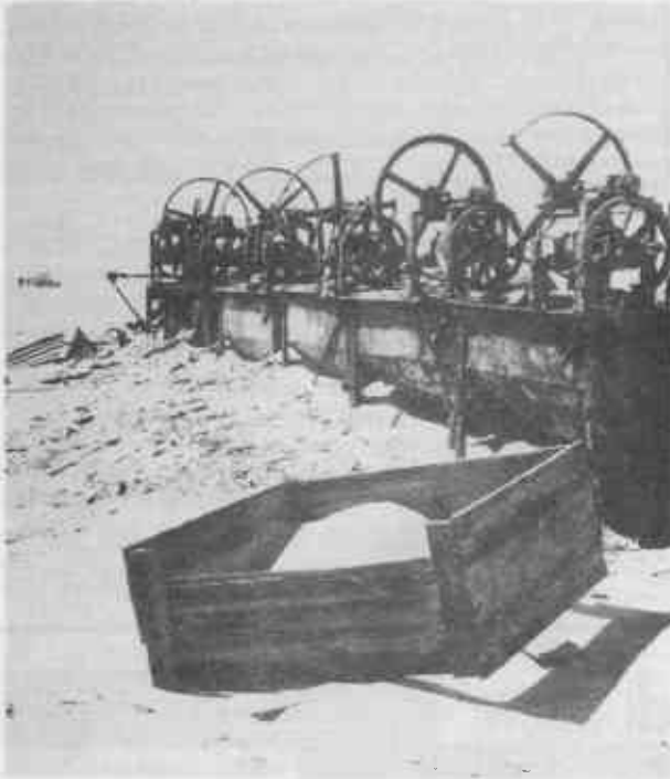
Mining machinery abandoned by the Germans when they moved out in 1929.