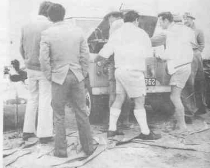
Starting the Landrover. Some just stand around and some just offer advice.

be! Hatches are battened down, two of our angling experts hook off the chocks with rod and line, and 'plane and passengers roll across the tarmac. Throttles open and burdened down with booze below the Plimsoll line, w rumble off for lift. Airborne, if I'm not mistaken, j short of Port Nolloth. The two hour flight, nausea apa is best remembered by the boilermakers' pools. Boilermakers are well-known as inveterate gamblers and pool operators. Prepared to lay the odds on anything from fish to rugby scores. However, your angling correspondent has little to grumble about; he shared the fruits of victory with Security Ben Wiese in estimating correct arrival time at Meob. He was one minute out. The pilot I might add was incorruptible. Meanwhile, the boilermakers were up and down the centre aisle like chronic dysenterics.