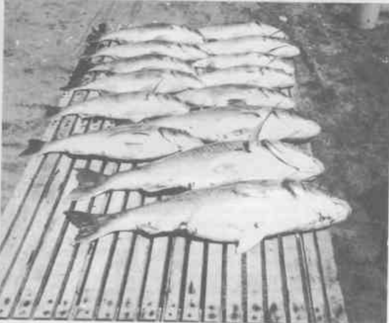
Charl van der Merwe's group got the best haul on the Sunday morning

Further up the beach and 200 metres back from the beach - I paced it - another old wreck. Maybe last cen-