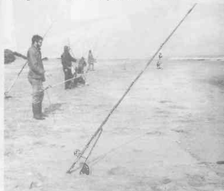
A forest of rods on the final morning

A group of gambok - wonder why they're fatter than ours - scatters from our path. It's cold and misty this morning. Cold's more of a problem than the heat. An