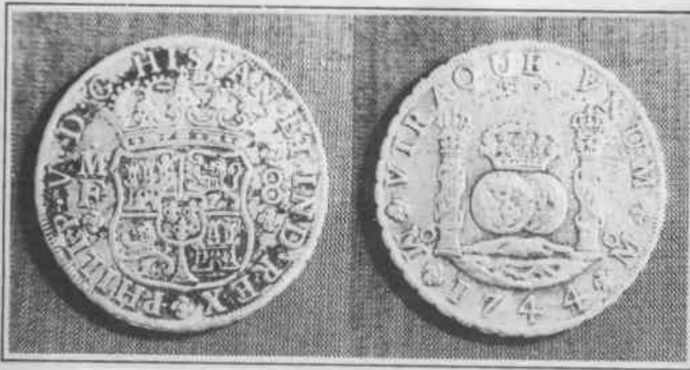
A silver 'piece of eight' found at Meob Bay on a previous visit

trip a much more valuable piece-of-eight. Finder (C.A.C.S.) tells me he's heard it's worth quite a sum. Didn't matter if he caught no fish that trip.