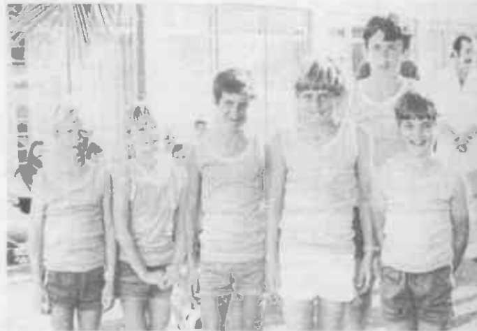
A team from 'Oppenheimer' House at the O.P.S. was 4th