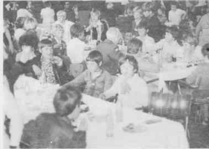
AT THE END-OF-SEASON PRIZEGIVING AND SOCIAL

the season as much as the boys did. Thank you also to the parents for their backing. We hope to see you again, around the ground with your boys next season.