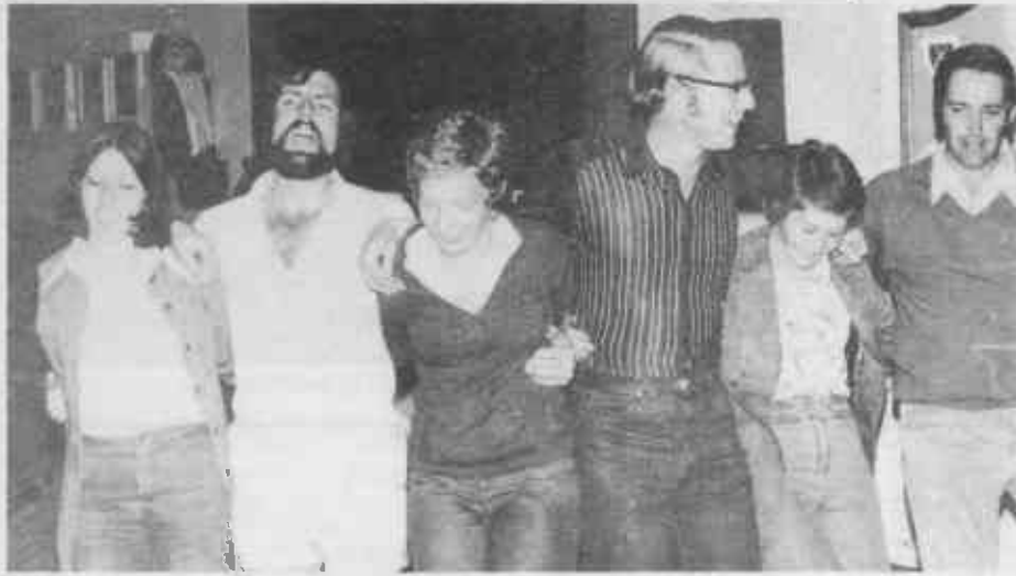
There were a couple of good parties during the weekend that V.O.B. visited us

The 1975 season ended with a flourish with the visit of Varsity Old Boys and Girls over the last week-end August. And how they enjoyed themselves!