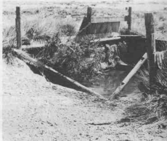
Fischer's Brunn, the water hole near the camp

Getting near the end now. Everyone but the angling