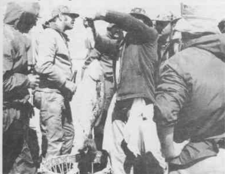
Weighing in - a lesson in concentration

Reminds me how careful you have to be about food. Fellow angler forgot to lock the door of his hut when he