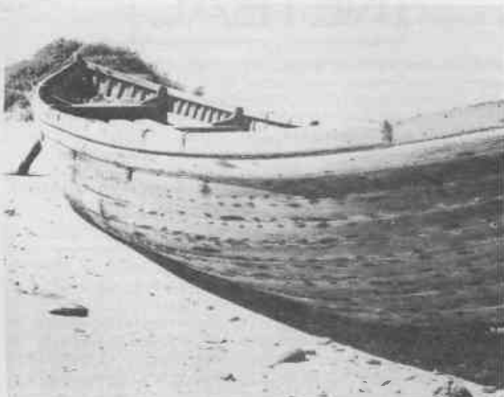
A longboat at the whaling station, nearly good enough to put to sea.

Landrover won't start. Battery flat on this one also. With Boet's help our Gerry - Gerry H- gets us away at sunset. No lights, no brakes. Follow-my-leader back to camp in the dark. Fish beginning to bite. One last