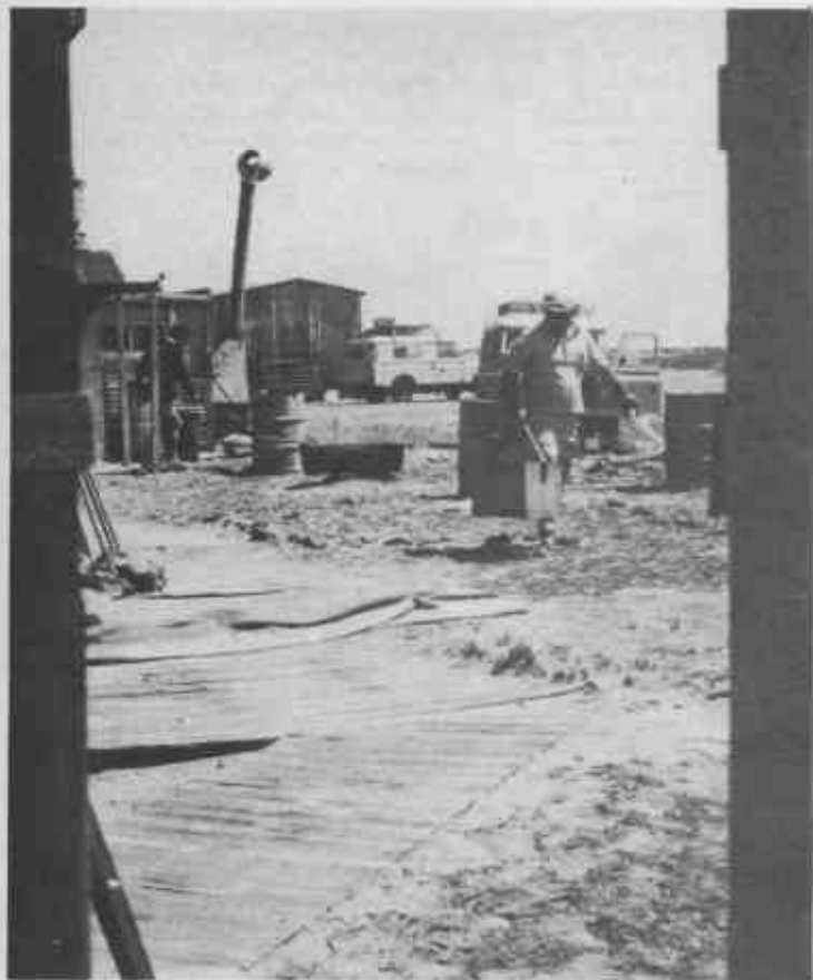
The camp. Even the chimney was inebriated

The shacks have been erected in a three-quarter circle cluster. Eight or nine huts for group-living and sleeping quarters, including one for the aircrew who always participate in these trips. Three, four or five anglers to a hut as hut-size varies; so does angler size. There