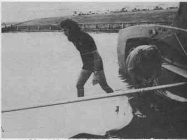
Others with more patience rigged up on Sunday

the 'Agate' series were sailed. At this stage it impossible to predict who will win the series on handicap. There are a number of crews whose score very close to each other. This is anyone's series sail well - maybe you will win. The average number of boats on the water so far the season has far exceeded the number seen in previous years. It is really wonderful to see so many yacht sailing around the start line waiting to cross first the sound of the gun. Having lots of boats on the water makes racing so much more interesting as there are more opportunities to win by using tactics to get past fellow sailors. We can only hope that the number of boats will increase even further and that the number