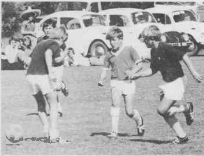
Two incidents in the Town versus Central match.