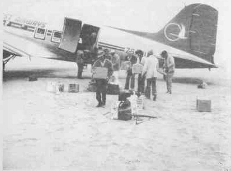
Local stevedores unloading at the camp airstrip

were handled with a reverence more suited to the Holy Grail.