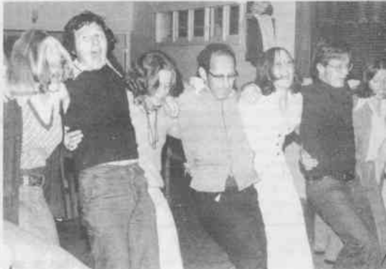
Things went with a swing in the Hockey clubhouse that night