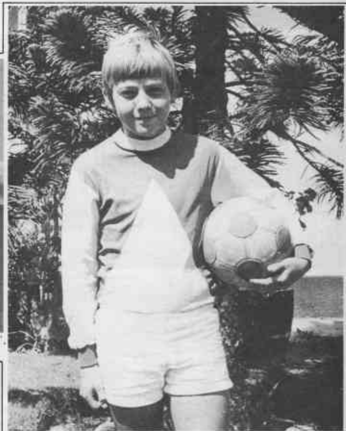
PLAYER OF THE YEAR