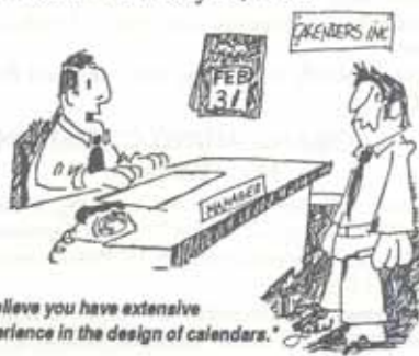
"I believe you have extensive experience in the design of calendars."

A CDM employee recently received a letter which gave the date of renewal of his two-year contract as February 31, 1992.