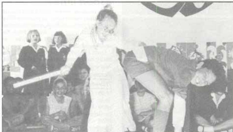
OPS is so wonderful, the children even enjoy the discipline.