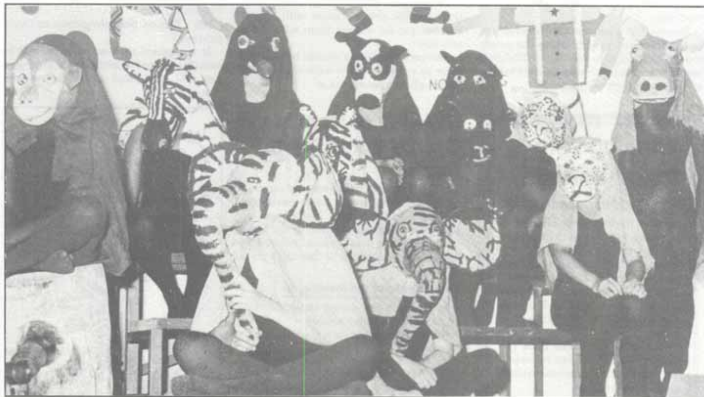
Noah's ark animals waiting for the flood.