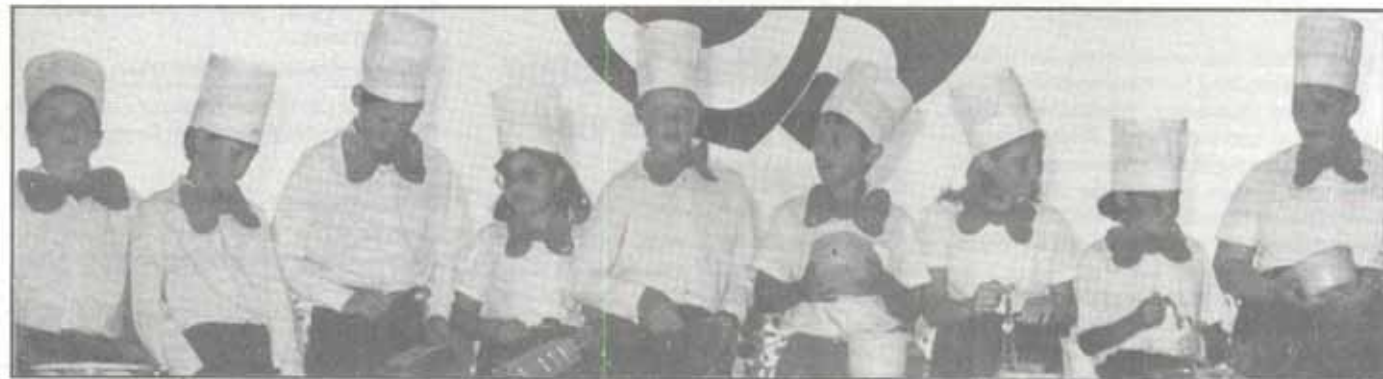
The "kombuls orkes" cooking up a storm!