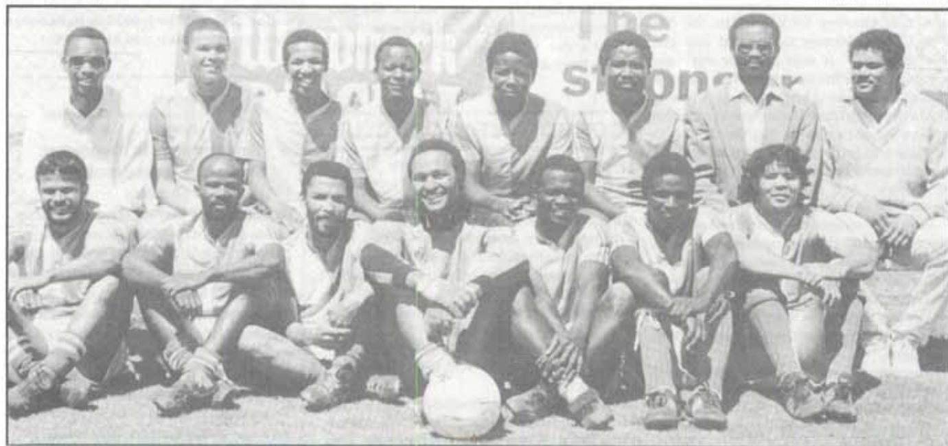
Sure fire stars Ocean Spurs won the Knock-Out Cup and the end of season Namibia Breweries Classic Cup.