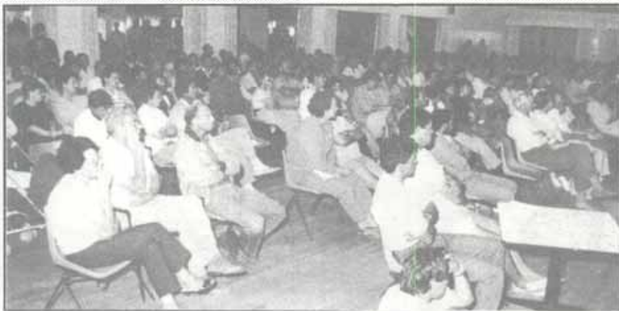
More than 800 ex-patriate employees, attended Monday night's meeting called to clarify Government requirements under the Citizenship Act.