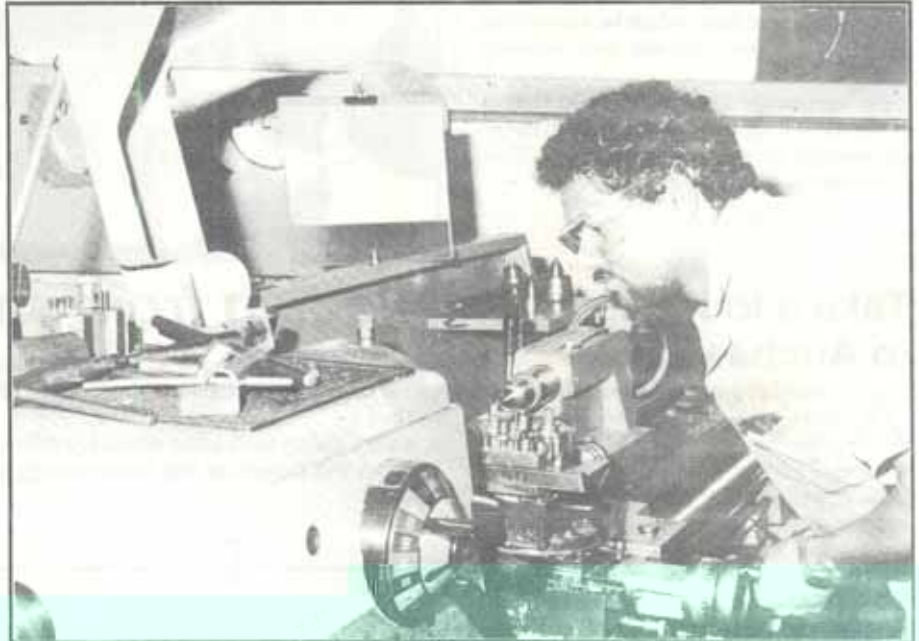
A CDM apprentice being trained at the mine's Apprentice Training Centre which is second to none in Namibia.

chas as assistant fitters and boilermakers, servicemen in the diesel section and more recently as instrumentation assistants. Trainees are recruited every three months for the course which includes practical and theoretical instruction.