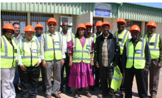
SOME OF THE DIAMOND FESTIVAL DIGNATARIES SEEN HERE BEFORE ENTERING SOUTHERN COASTAL MINES FOR A VISIT