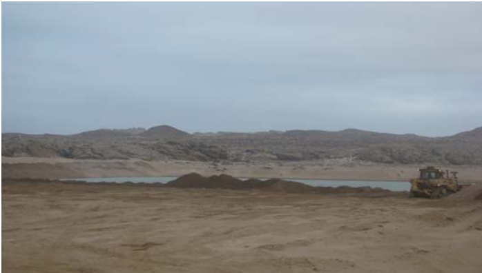
BACKFILLING OF MINED-OUT PONDS AT POCKET BEACHES