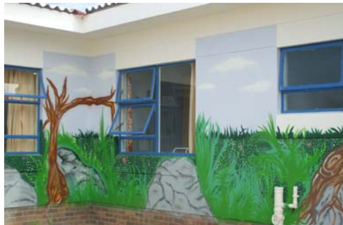
NEWLY PAINTED MURALS AT THE LÜDERITZ HOSPITAL