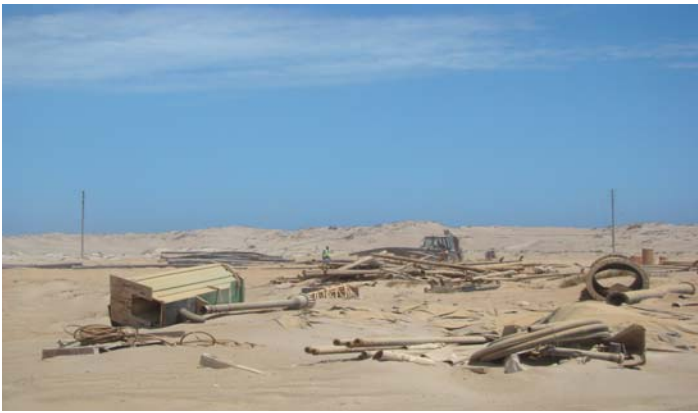
NON SALABLE WASTE WAITING TO BE REMOVED OFFSITE.