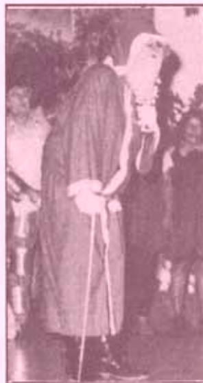
Fr Christmas tells the children never to wander off without first telling their parents.