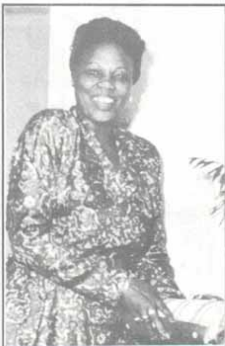
Minister of Local Government and Housing, Dr Libertine Amathila.

Minister Amathila was also given a skirt sewn by the Christian Women and a traditional baby sling made of material in the colours of the Namibian flag. It symbolises the Minister's responsibility of carrying the women of Namibia next to her body, near her heart. ♦