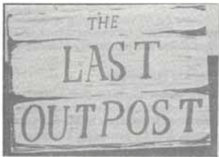
Lamb's Park bar renamed - the last watering hole before the infamous desert Badlands.