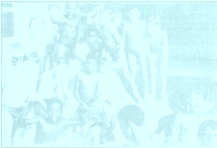
Boisterous cubs cool off in Chil's swimming pool.

Chil's swimming pool was the main attraction for the Cubs' party. The Cubs had a marvellous time splashing around and games and competitions took place in the water. Popcorn did well not to be drowned by high-spirited Cubs, and Aska and Chil had to keep at a safe distance to avoid the enormous splashes from the pool. The Cubs enjoyed ice-cream and good drink which recharged their batteries for more games in the pool until it was time to go home. ♦