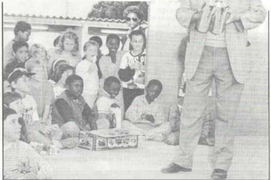
A hotline to Santa Claus.