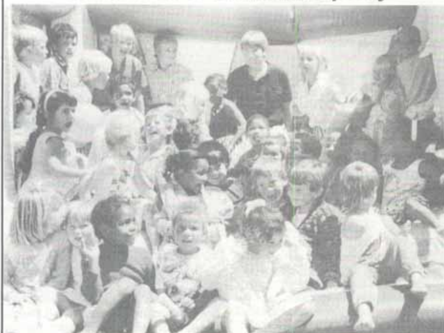
Fun-a-plenty in the Jumping Castle, the main attraction at the Day Care Centre Christmas party last Friday.